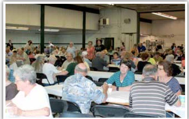
Members enjoy a meal before the annual meeting.

The Annual Members Meeting of Polar Communications was held on Thursday, June 6, 2019. A total of 131 members registered during the meeting. Members and guests were served a chicken, mashed potato and gravy meal prior to the meeting.