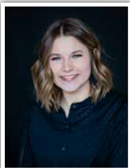
Gracy Cole Park River Area School