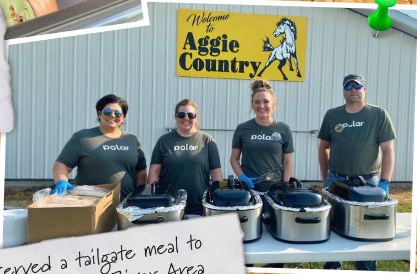
We served a tailgate meal to support the Park River Area Aggie boosters