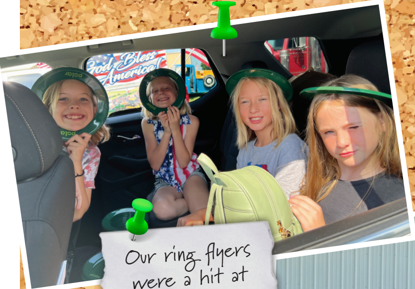
Our ring flyers were a hit at area parades this summer.