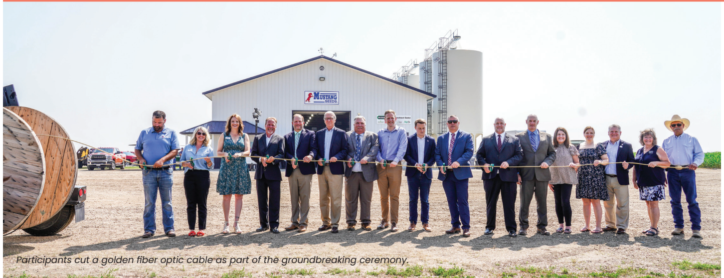
Participants cut a golden fiber optic cable as part of the ground-breaking ceremony.