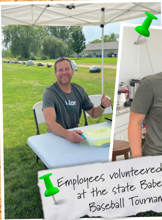
Employees volunteered to work at the state Babe Ruth Baseball Tournament.