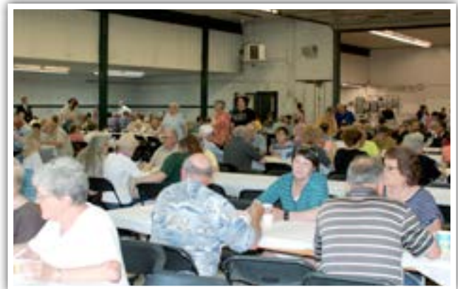
Members enjoy a meal before the annual meeting.

The Annual Members Meeting of Polar Communications was held on Thursday, June 6, 2019. A total of 131 members registered during the meeting. Members and guests were served a chicken, mashed potato and gravy meal prior to the meeting.