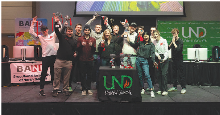
Winners from the 2024 Esports state tournament held at UND.

Polar is a proud supporter of the Esports teams for Cavalier, Park River/Fordville, Dakota Prairie, Grafton, Mayville, and Northern Cass schools. Follow Fenworks to stay updated on every match and moment!