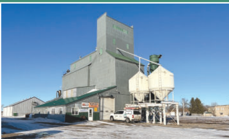
Novak Grain and Feed in Lankin, ND.