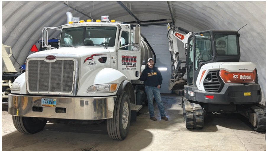
Novak's septic cleaning service has grown to serve over 300 customers.

We provide tailored services to meet your business needs, from security systems and surveillance cameras to paging and phone solutions. Visit polarcomm.com/business to learn more and request a free quote.