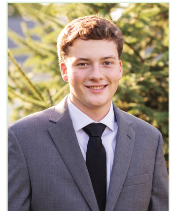
Caleb Rutherford Park River Area School